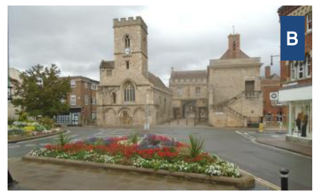
St Nicolas Church