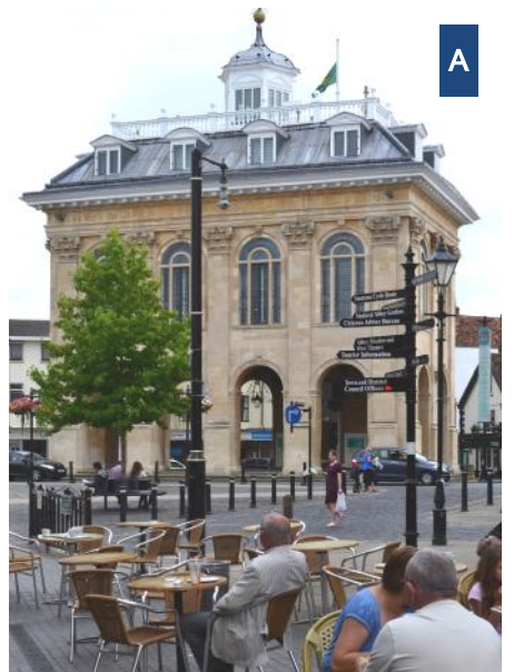
Old County Hall (now town museum) and market place

Short walk taking in may beautiful sights and views of the town.