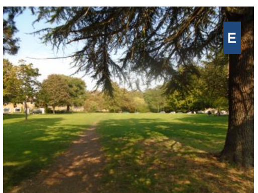
Field by Fitzharry's Road