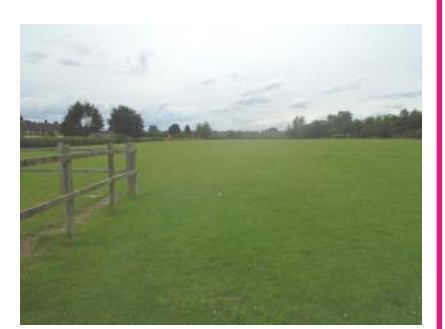
Large extent of Caldecott Recreation Ground