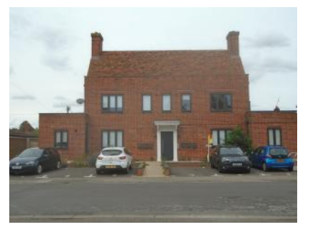
Old Saxton Arms, now apartments